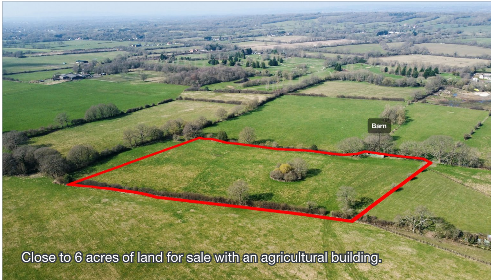
Close to 6 acres of land for sale with an agricultural building.