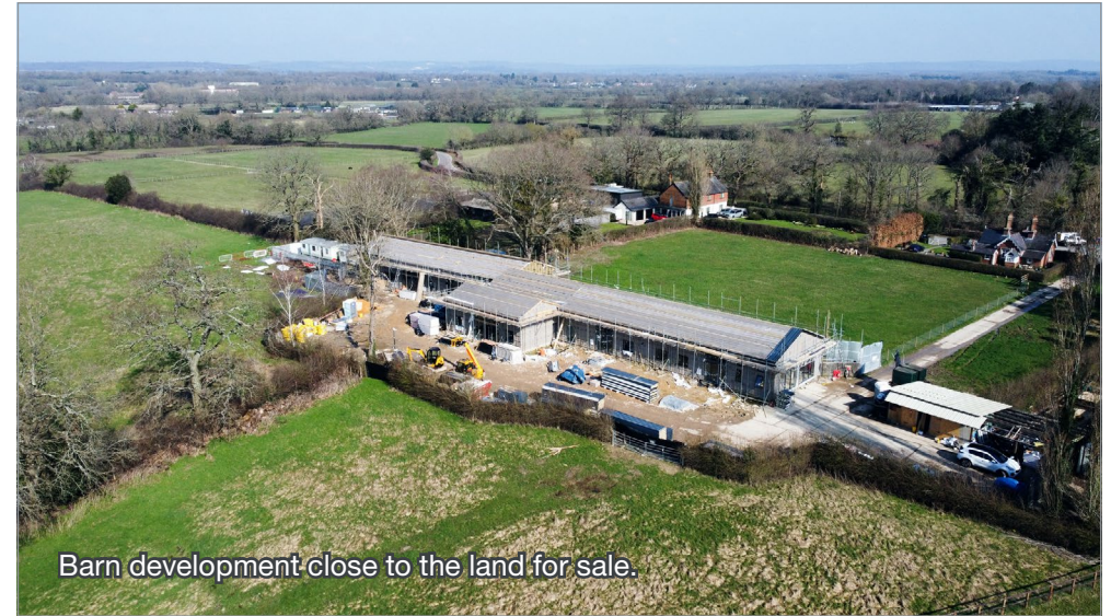
Barn development close to the land for sale.