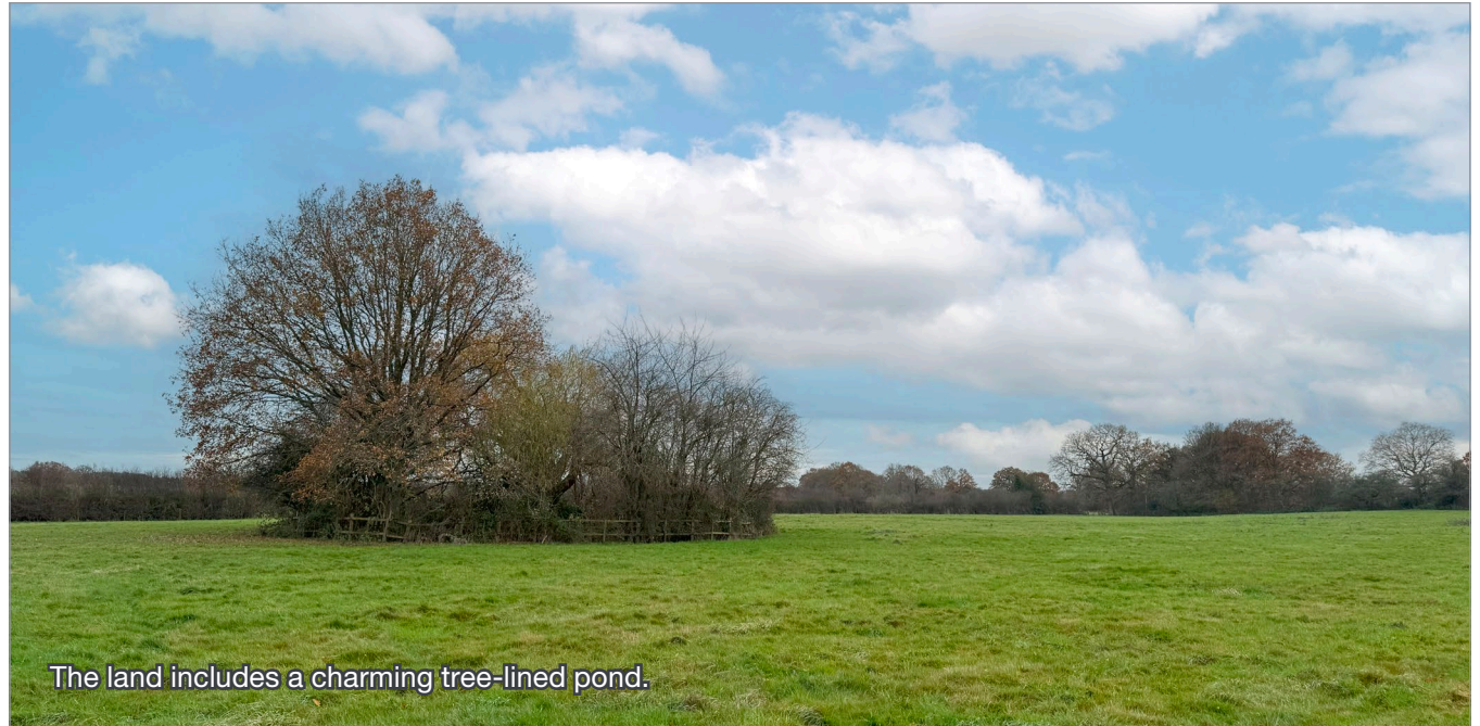
The land includes a charming tree-lined pond.

These rises are driven by historically low levels of land availability, as demand continues to outstrip supply.