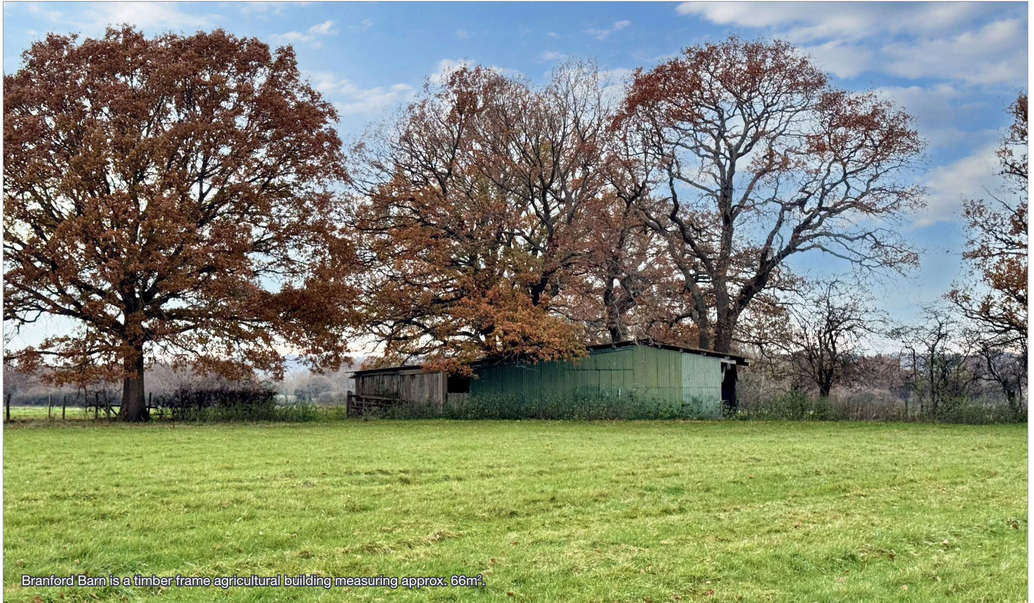
Branford Barn is a timber frame agricultural building measuring approx. 66m 2 .