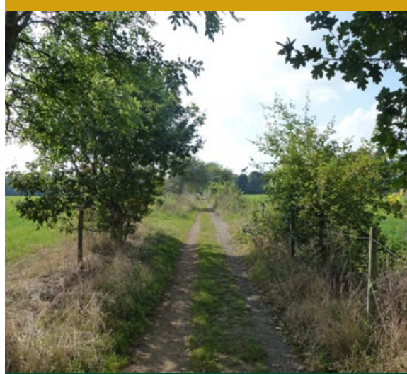
Bridleway leading to Bricket Wood Common