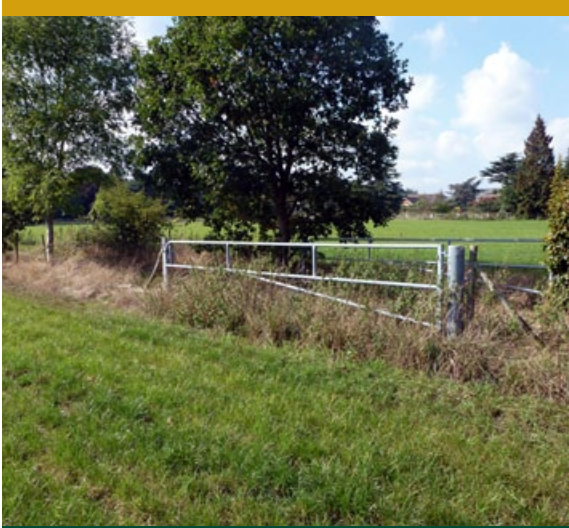
Access to the bridleway through Lot 7