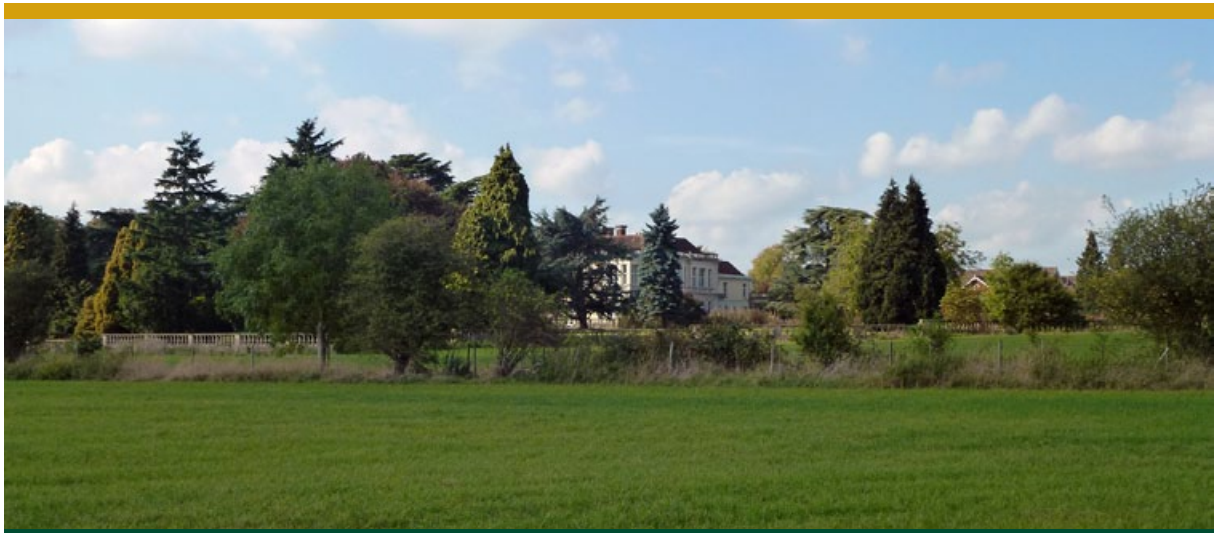
View of the proposed development on Green Belt land to the north of the site