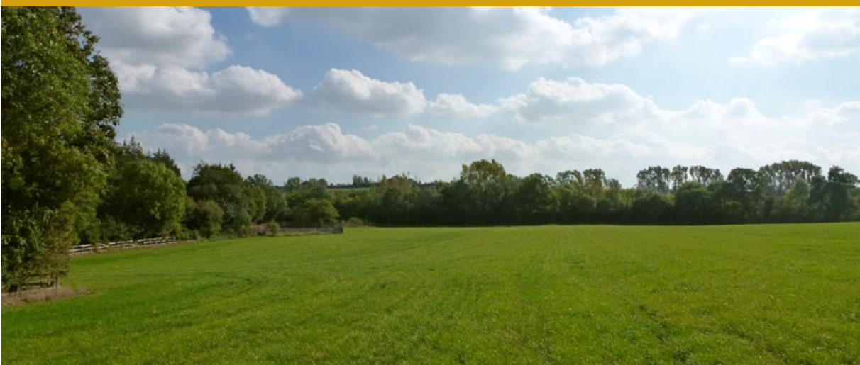
View of Lots 1 & 2 from Lot 8