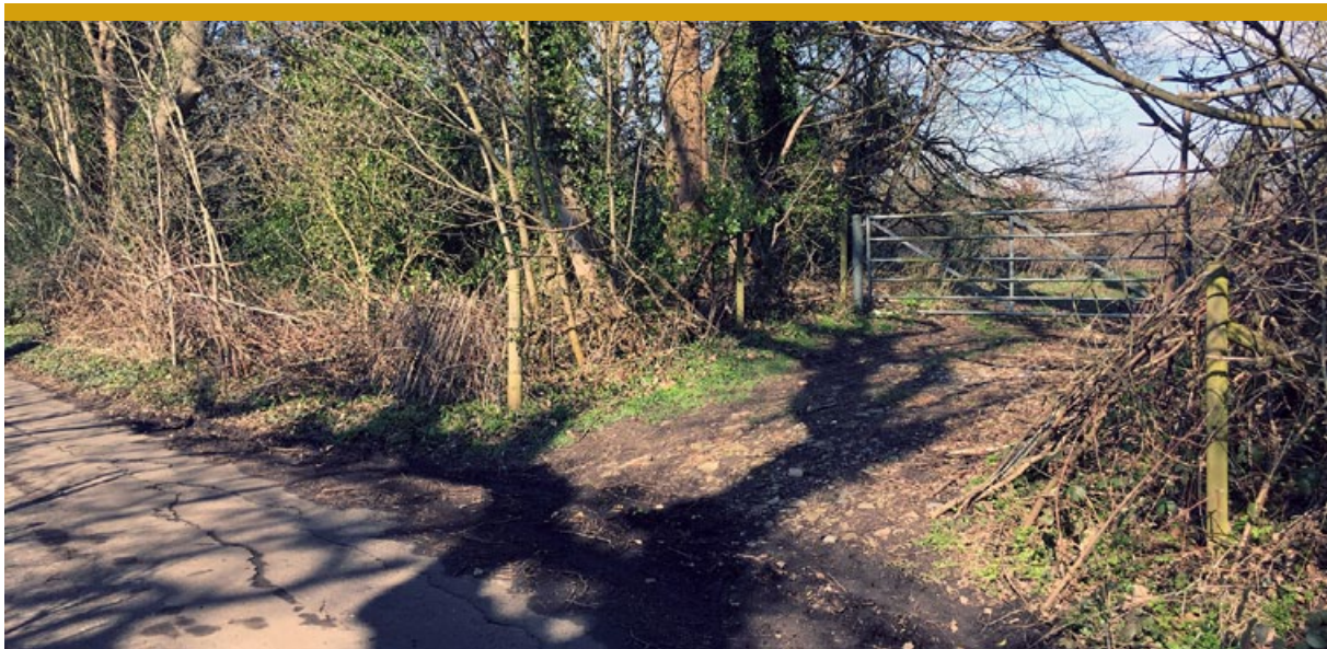
Gated access into Lot 2 off Kenley Lane

To arrange a site visit, please call 01727 701303 or email enquiries@vantageland.co.uk .