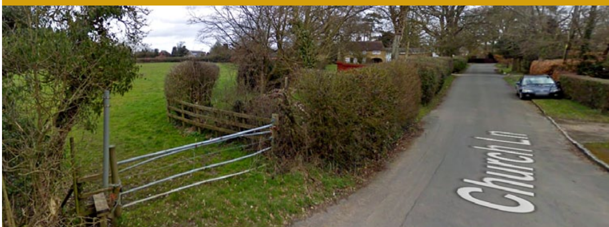
Direct access from Church Lane (image from March 2010)

To arrange a site visit, please call 01727 701303 or email enquiries@vantageland.co.uk .