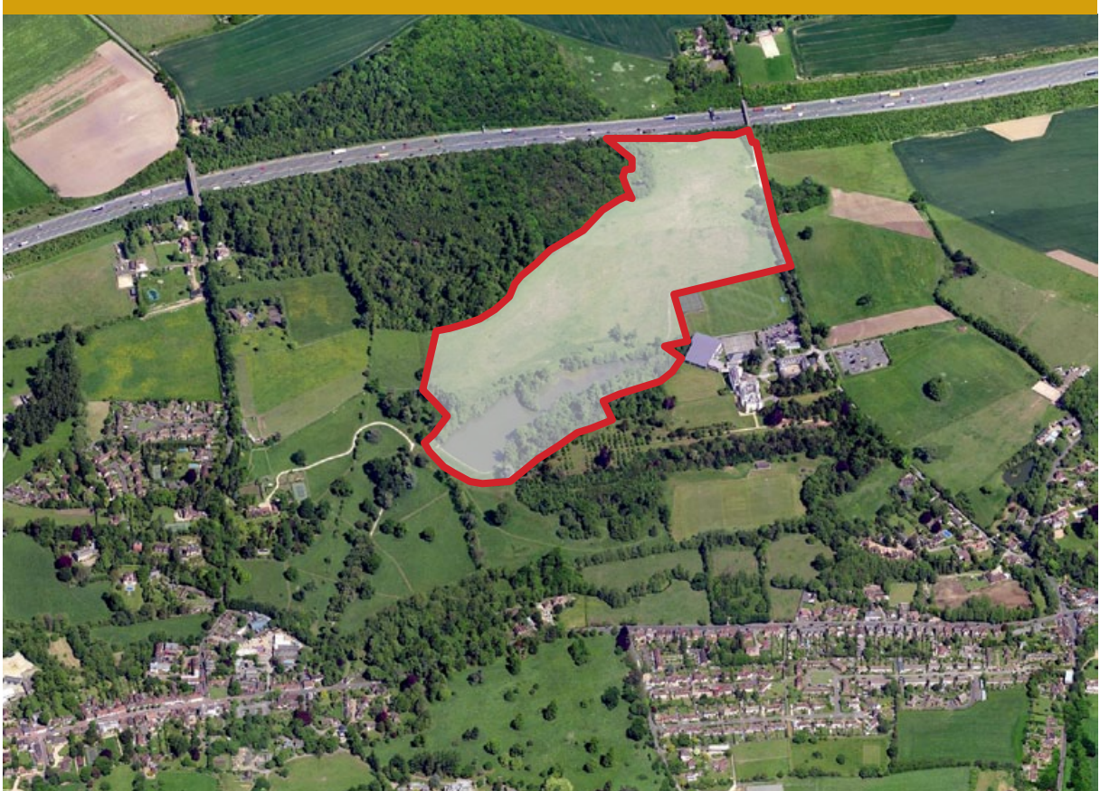
Aerial image of the land for sale strategically located on the edge of the M25 and Sundridge, Sevenoaks