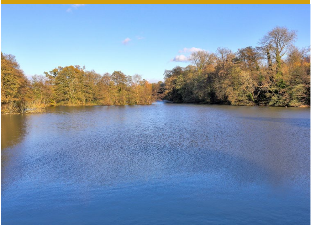
A rare opportunity to purchase this beautiful, well stocked lake set within 11.29 acres