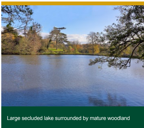
Large secluded lake surrounded by mature woodland

The land is designated as green belt and falls within the Kent Downs Area of Outstanding Natural Beauty (AONB). Lot 11 (the lake) also falls within the Sundridge Conservation Area. Any development would be subject to the appropriate planning permission.