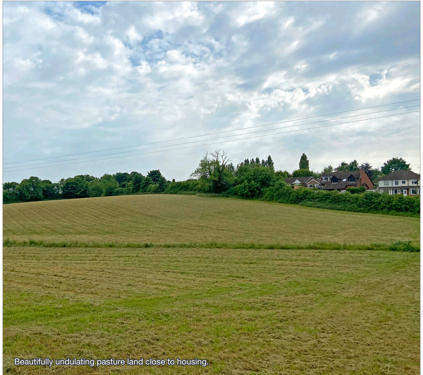
Beautifully undulating pasture land close to housing.

Dunstable Downs and Whipsnade Zoo – the UK's largest – are very close by, as is the excellent Stockwood Park & Discovery Centre.