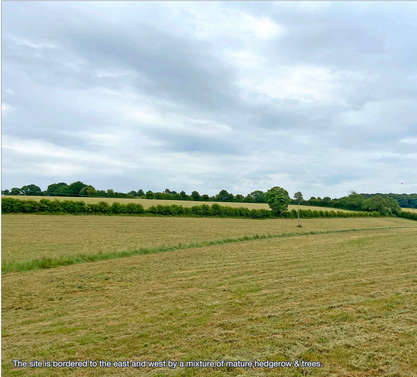
The site is bordered to the east and west by a mixture of mature hedgerow & trees.